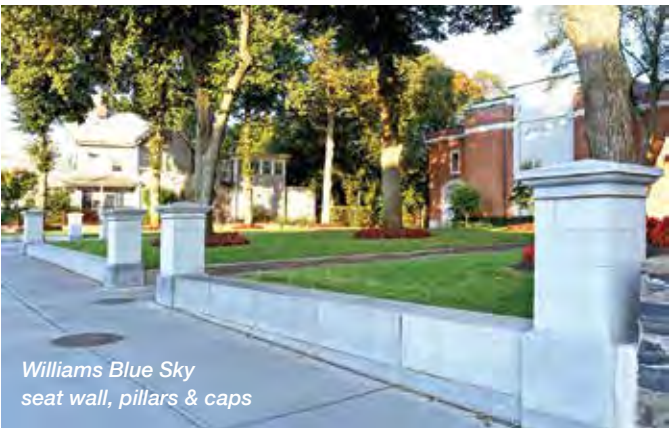
Williams Blue Sky seat wall, pillars & caps