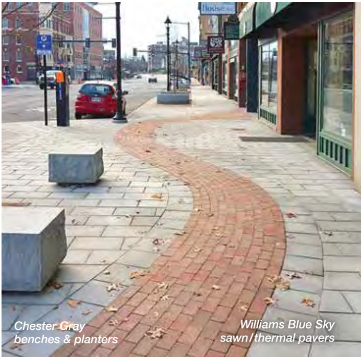
Chester Gray benches & planters