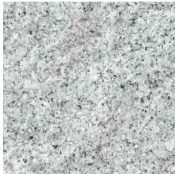
Williams Blue Sky™