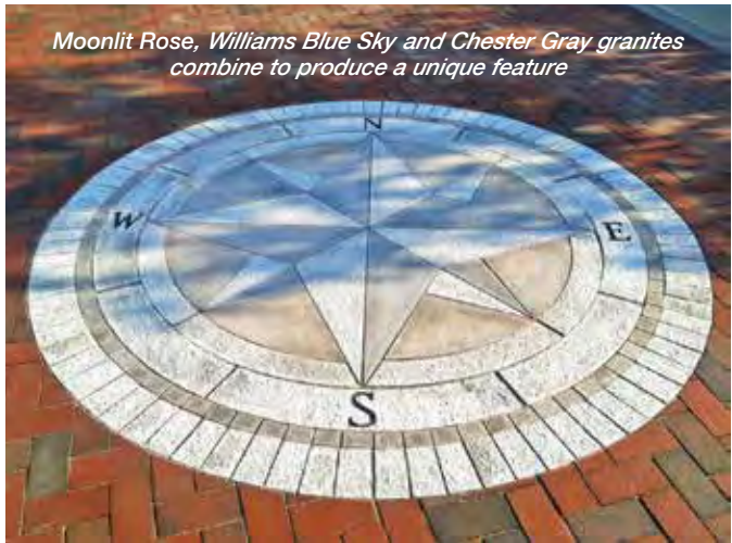
Moonlit Rose, Williams Blue Sky and Chester Gray granites combine to produce a unique feature