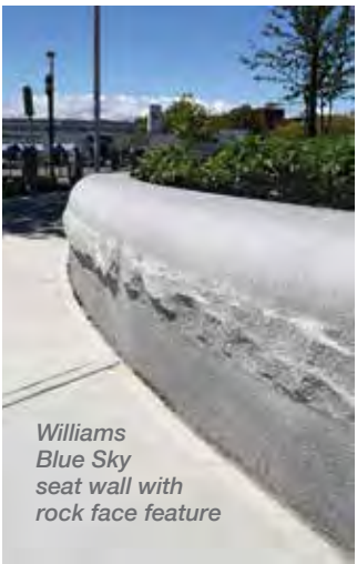
Williams Blue Sky seat wall with rock face feature