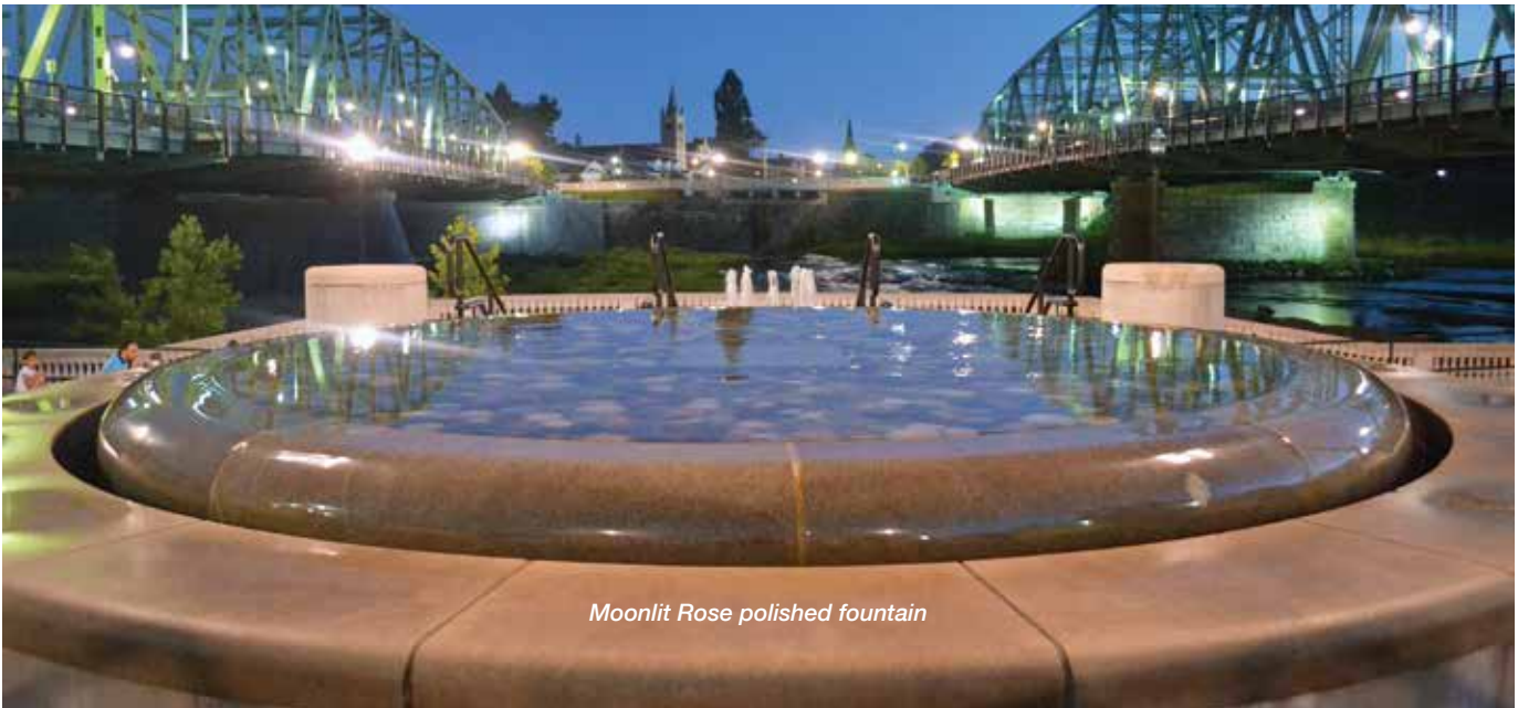
Moonlit Rose polished fountain