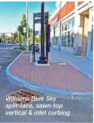
Williams Blue Sky split-face, sawn-top vertical & inlet curbing