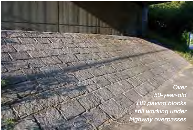
Over 50-year-old HD paving blocks still working under highway overpasses