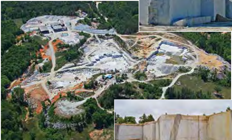
William Stone Company's Carlton GA quarrying operation