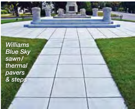
Williams Blue Sky sawn/ thermal pavers & steps

All our paving products are produced to NBGQA specifications.