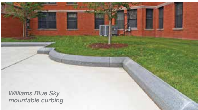
Williams Blue Sky mountable curbing