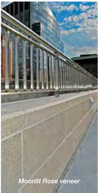
Moonlit Rose veneer