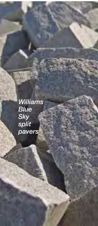
Williams Blue Sky split pavers