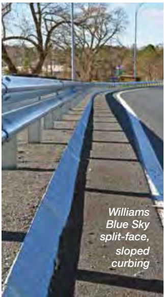
Williams Blue Sky split-face, sloped curbing