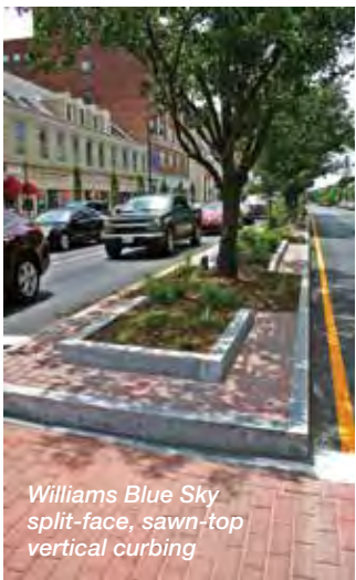
Williams Blue Sky split-face, sawn-top vertical curbing

Please visit our curbing pages for more information on specific types, sizes and details.