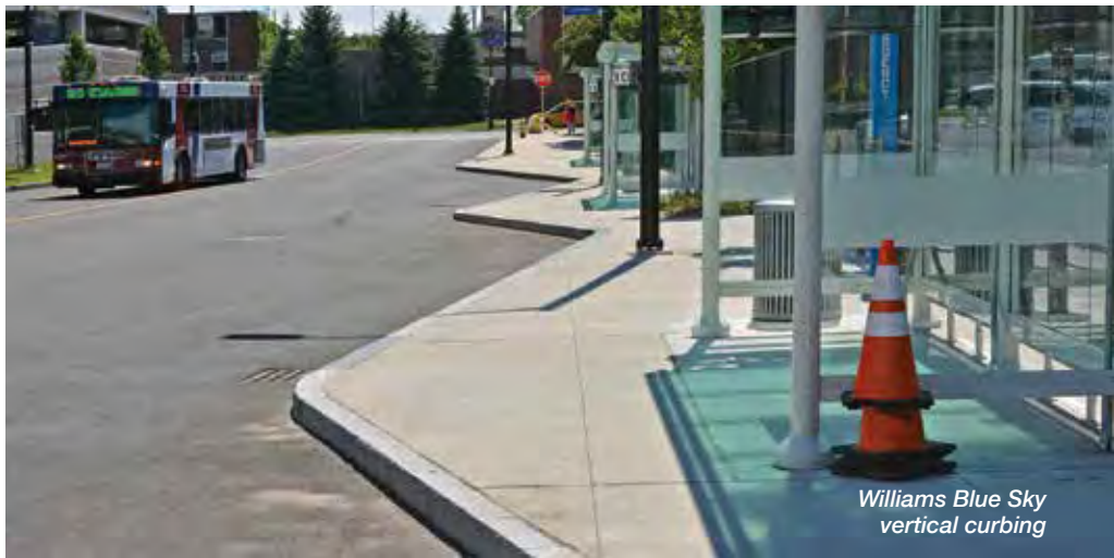
Williams Blue Sky vertical curbing