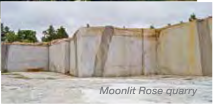
Moonlit Rose quarry