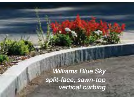
Williams Blue Sky split-face, sawn-top vertical curbing