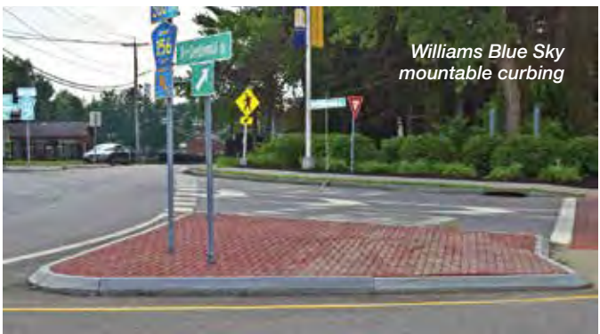
Williams Blue Sky mountable curbing