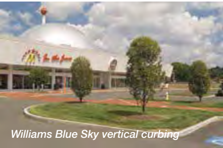
Williams Blue Sky vertical curbing