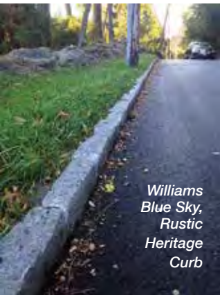
Williams Blue Sky, Rustic Heritage Curb