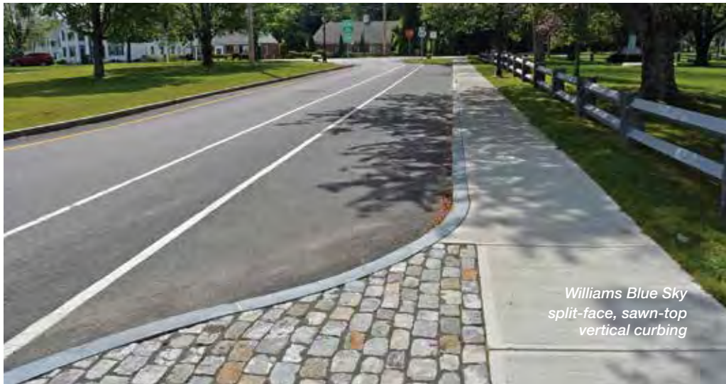
Williams Blue Sky split-face, sawn-top vertical curbing