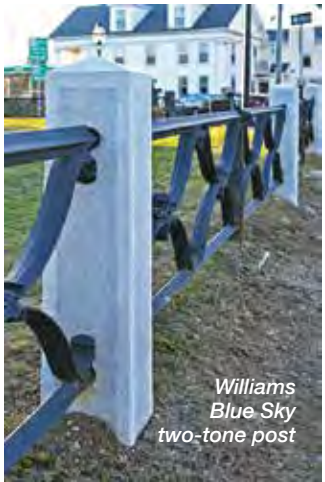
Williams Blue Sky two-tone post