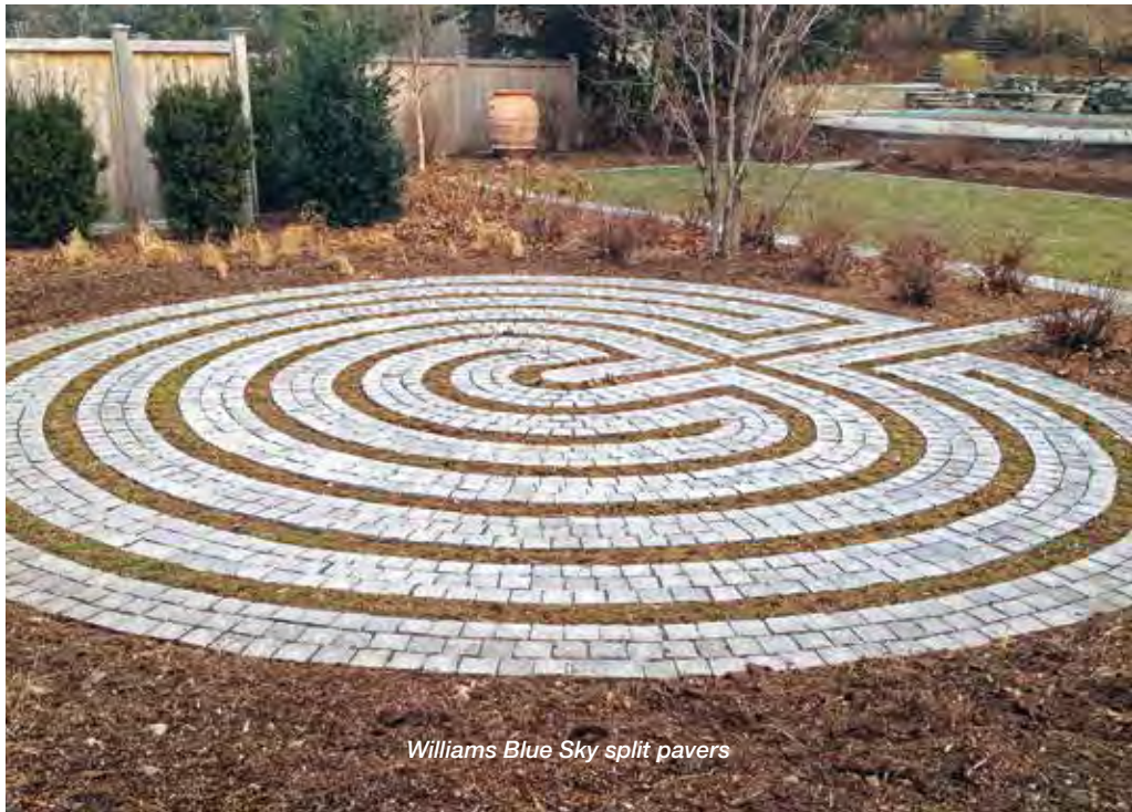
Williams Blue Sky split pavers