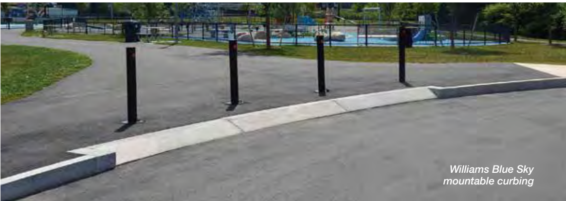
Williams Blue Sky mountable curbing