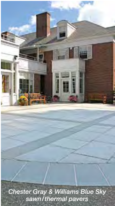
Chester Gray & Williams Blue Sky sawn/thermal pavers