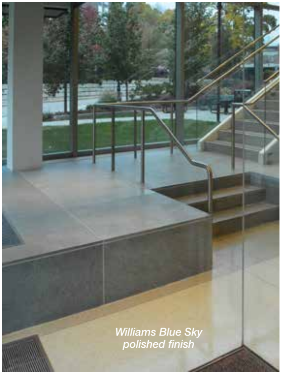
Williams Blue Sky polished finish