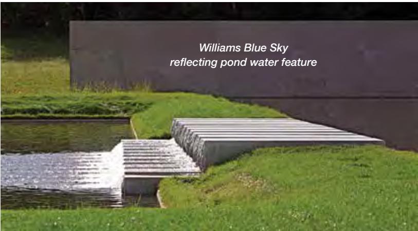
Williams Blue Sky reflecting pond water feature