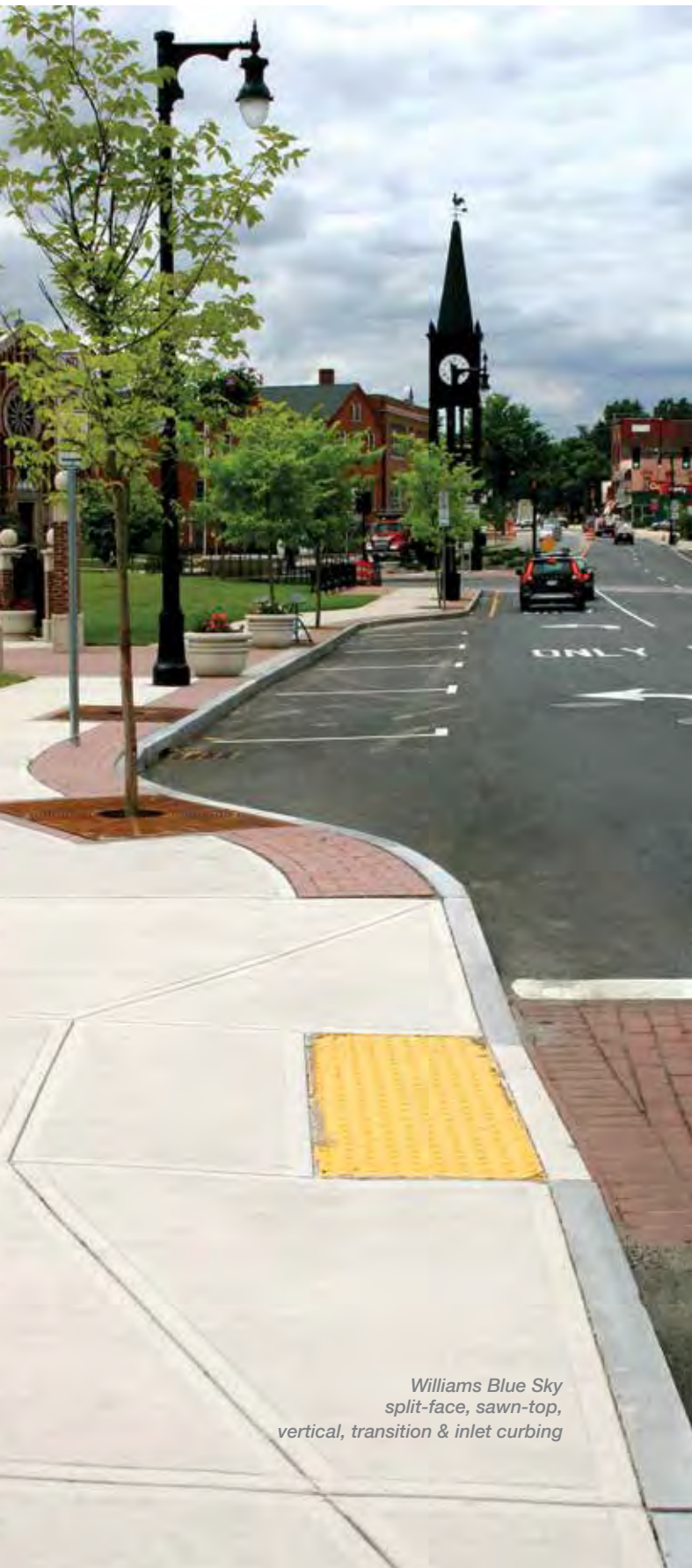
Williams Blue Sky split-face, sawn-top, vertical, transition & inlet curbing