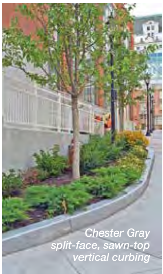
Chester Gray split-face, sawn-top vertical curbing