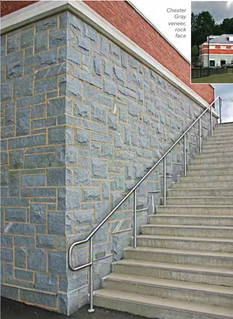
Chester Gray veneer, rock face