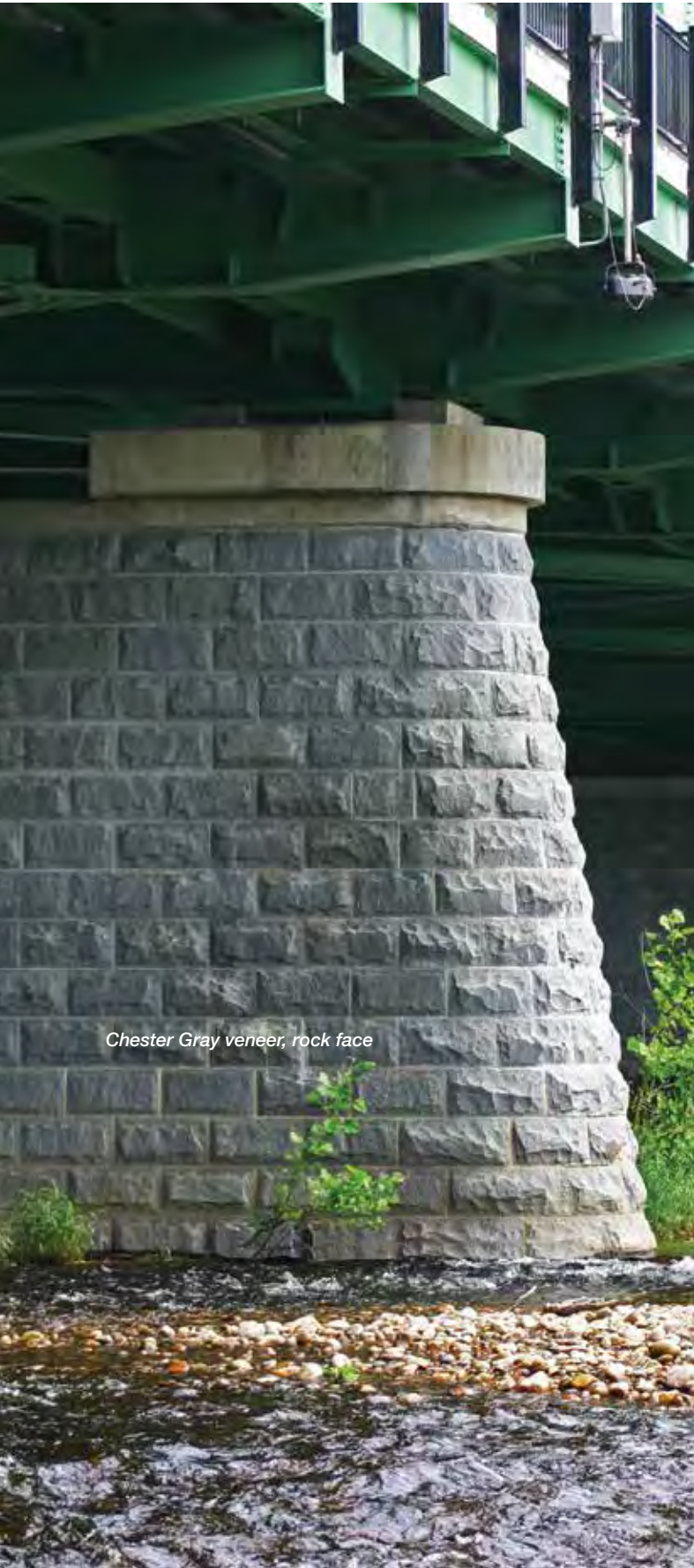
Chester Gray veneer, rock face

Enhances the design of any project while providing protection with all-natural durability. Williams Stone veneers are available in all of our granite colors and can be combined to provide a more dramatic visual layout. Finishes range from the traditional rocked face, split and hammered to the modern honed and thermaled.