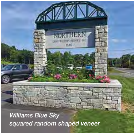
Williams Blue Sky squared random shaped veneer