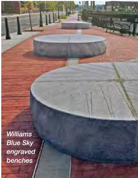
Williams Blue Sky engraved benches