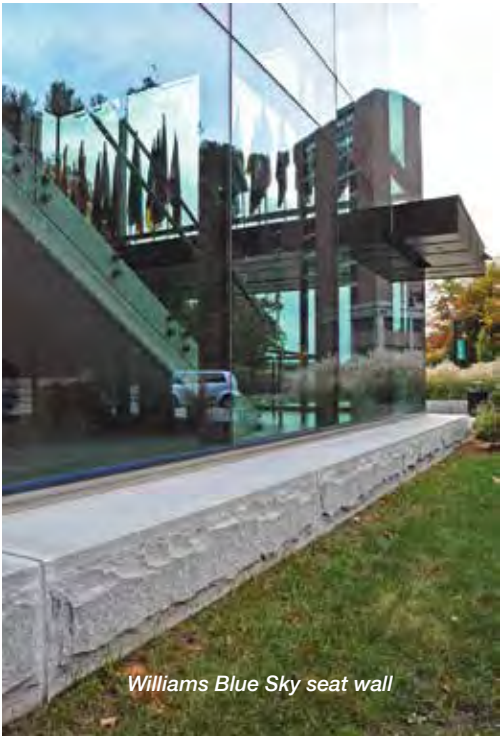
Williams Blue Sky seat wall