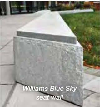
Williams Blue Sky seat wall