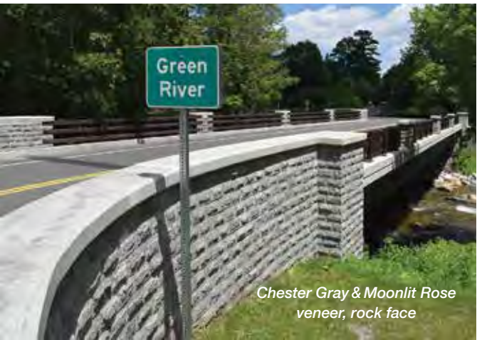
Chester Gray & Moonlit Rose veneer, rock face