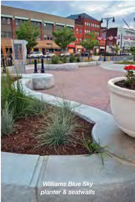
Williams Blue Sky planter & seatwalls