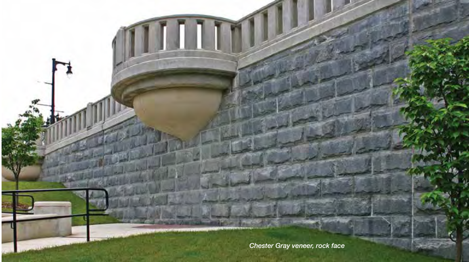
Chester Gray veneer, rock face