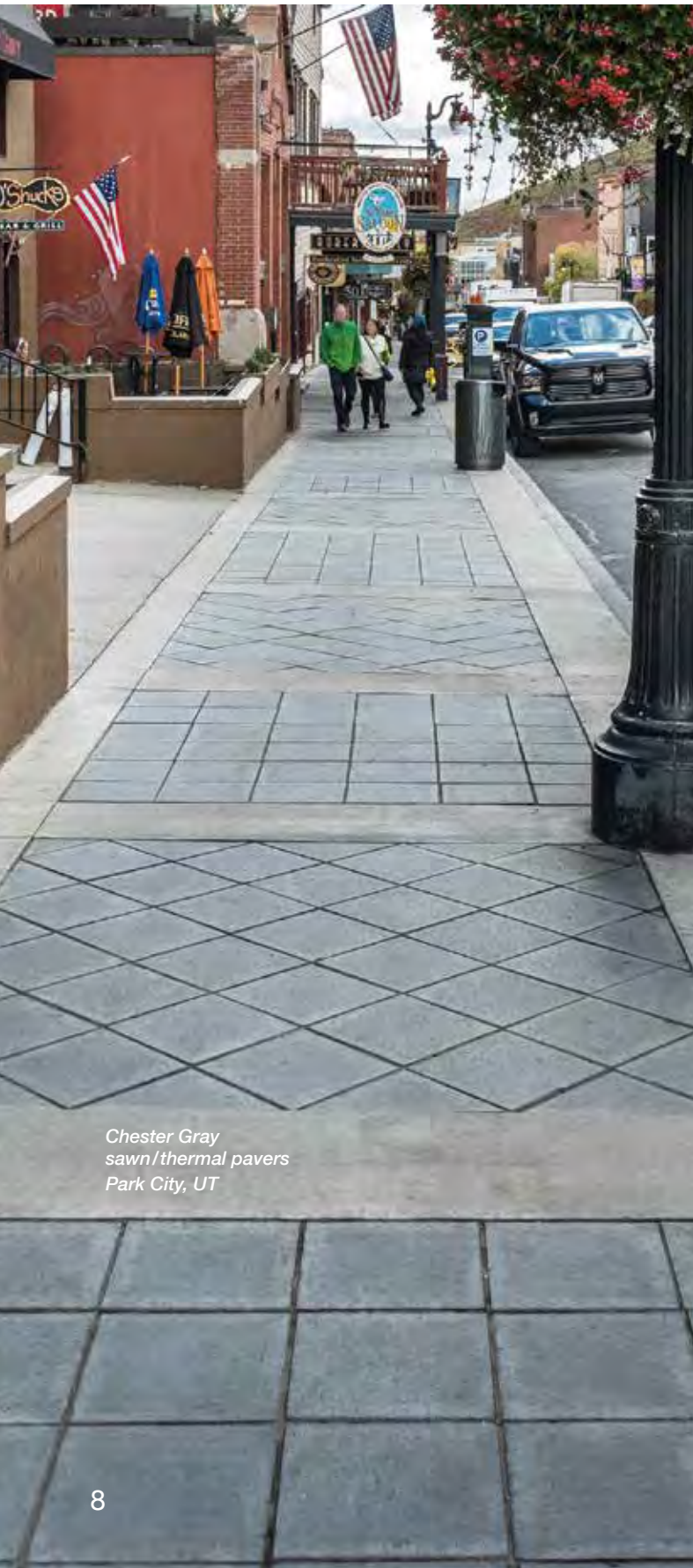
Chester Gray sawn/thermal pavers Park City, UT

We offer a variety of paving products, from sawn all sides thermal top to split, cobbles.