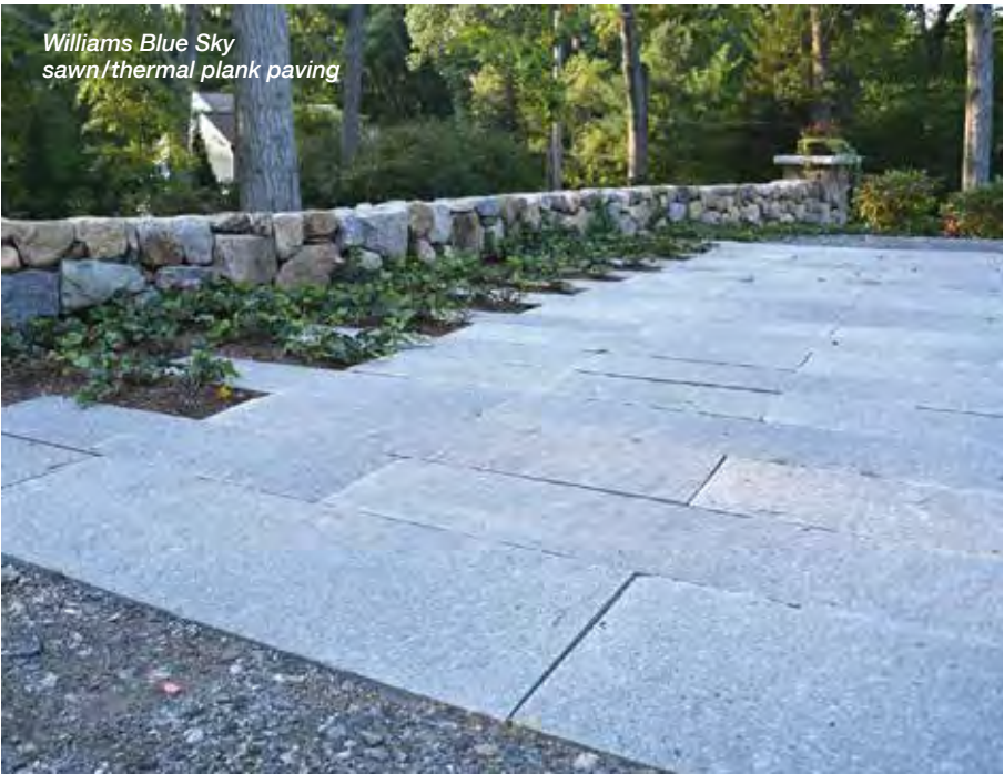
Williams Blue Sky sawn/thermal plank paving